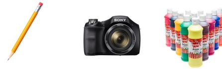
Pencils Camera Paint